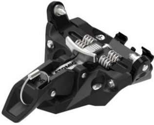
Recalled Atomic brand ski bindings (BACKLAND SUMMIT 12 LSH)