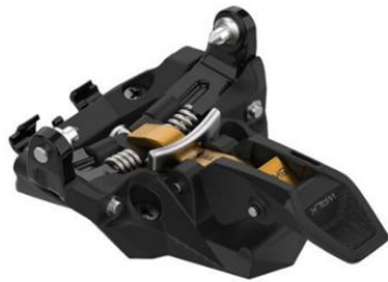
Recalled Salomon brand ski bindings (MTN SUMMIT 5 BR Gold)