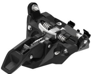
Recalled Atomic brand ski bindings (BACKLAND SUMMIT 5 BR)