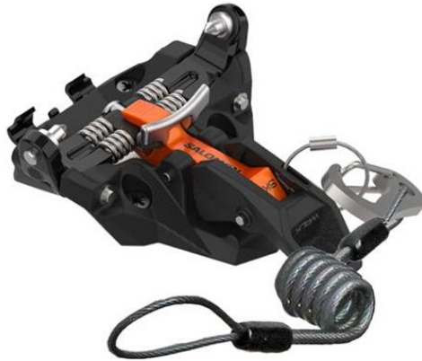
Recalled Salomon brand ski bindings (MTN SUMMIT 12 LSH Orange)